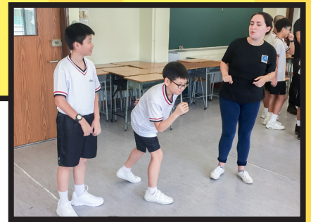
Add A Freeze

At the end of the day, students were overwhelmed with joy and satisfaction despite the amount of activities they had actively participated.