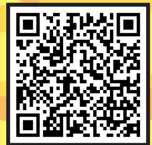
Recap of the show (QR code)