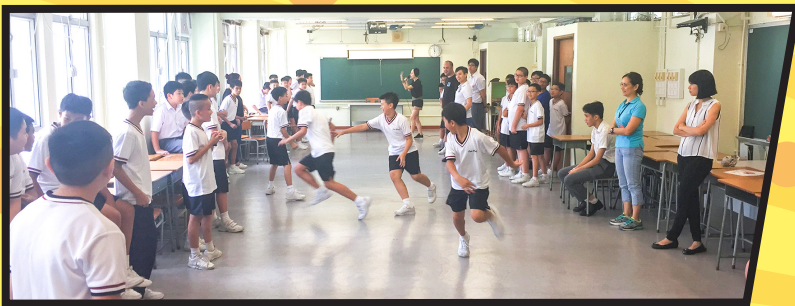
Crossing the river